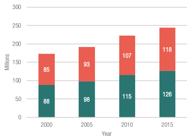
Figure 1: Total number of international migrants by sex

People have always moved across borders. In 2015, the global number of international migrants reached 224 million, up from 173 million in 2000. However, as a proportion of the world’s population, the number of migrants has remained relatively stable over the past 40 years at around 3%. Europe and Asia host the most international migrants (76 million and 75 million respectively), while southern Europe and Gulf States are the regions with the highest growth in labour migrants (UN DESA, 2016a).