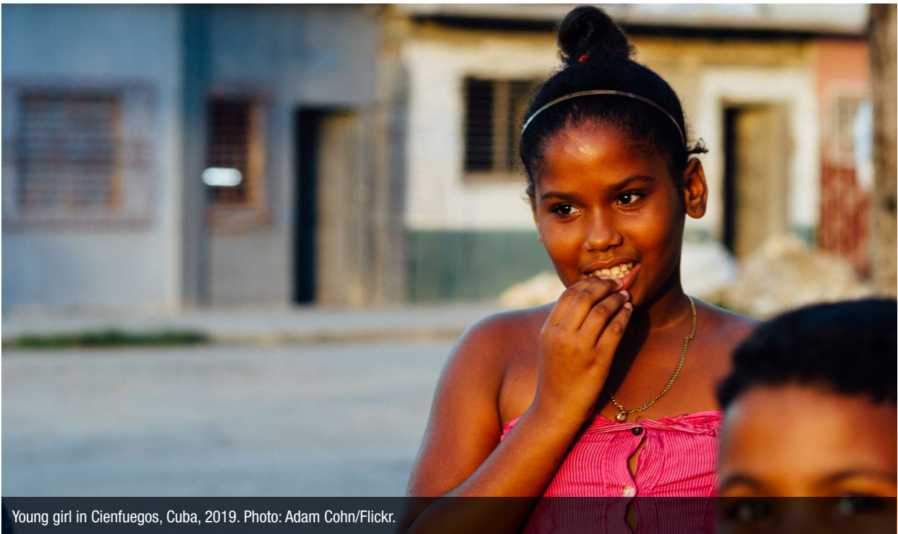
Young girl in Cienfuegos, Cuba, 2019.

Another relatively common response to violence was for the woman to break up with her partner. One respondent noted that it is now more acceptable for women to denounce men who mistreat them and to end the relationship than it was previously: