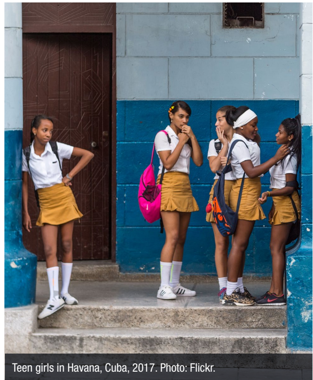
Teen girls in Havana, Cuba, 2017.

visits; they should be run by professionals but also include peer-to-peer approaches.